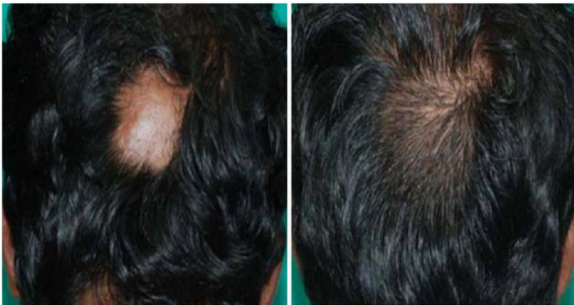
Figure 2. Alopecia areata on a 24-year-old man, before and after 3 months of PRP 6

Alopecia areata is a form of autoimmune hair loss without scarring, which affects the scalp with or without affecting the body. Treatment of AA based on the underlying disease. PRP therapy was introduced as an adjuvant therapy modality in AA, especially chronic alopecia areata. This therapy is easy to do and effective in AA, without side effects, and might offer useful therapies in AA. Although several studies have shown the efficacy of PRP therapy in AA, further randomized clinical trials need to be done to support the efficacy of this therapy. Concentration standards and preparation methods of PRP are also needed in order to produce a homogeneous PRP product.